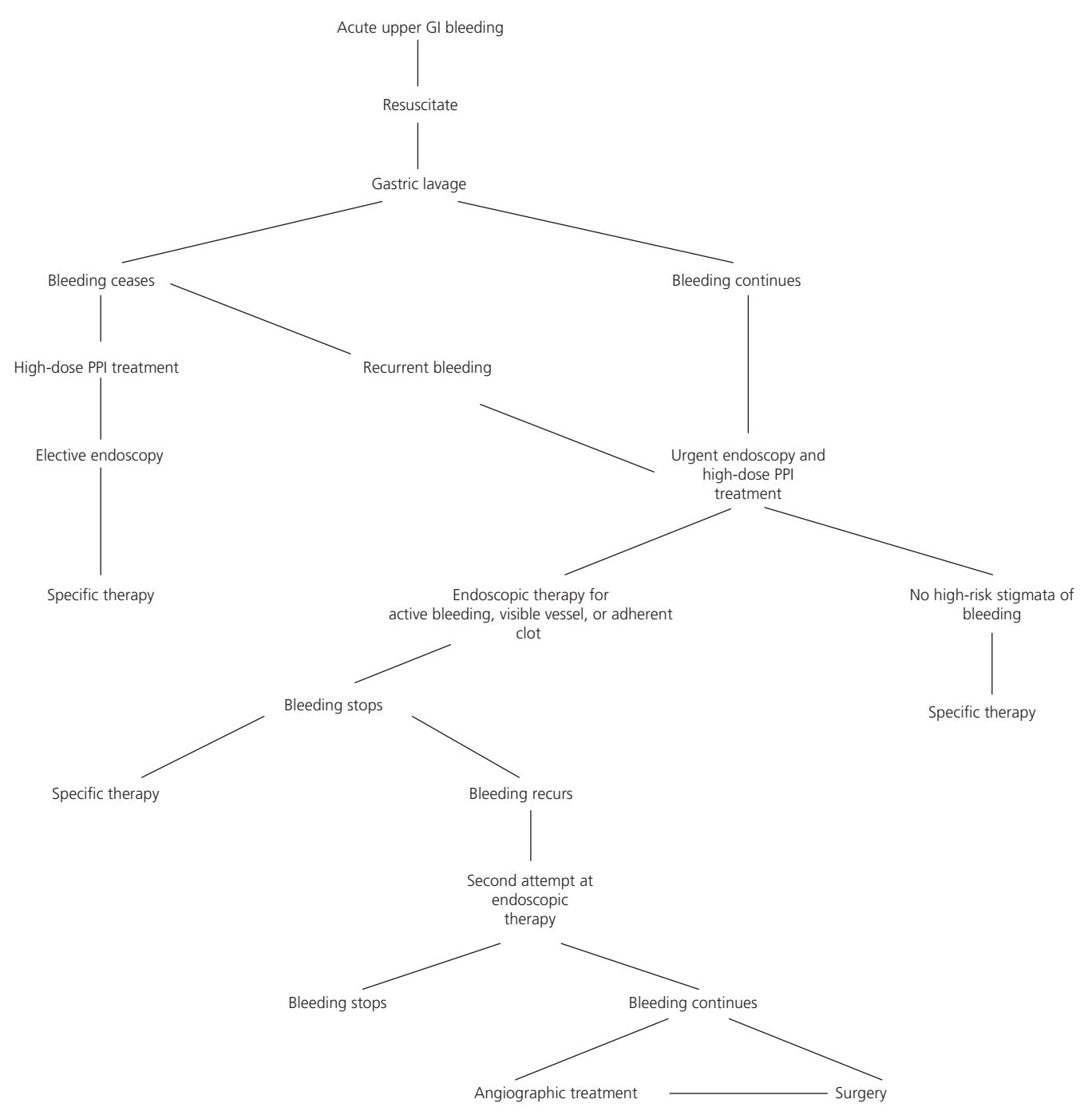
Figure 1.1 Algorithm for evaluation of nonvariceal upper GI bleeding. GI, gastrointestinal; PPI, proton pump inhibitor.